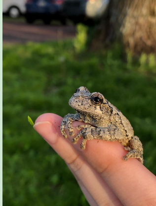
Grey treefrog ( Hyla versicolor )