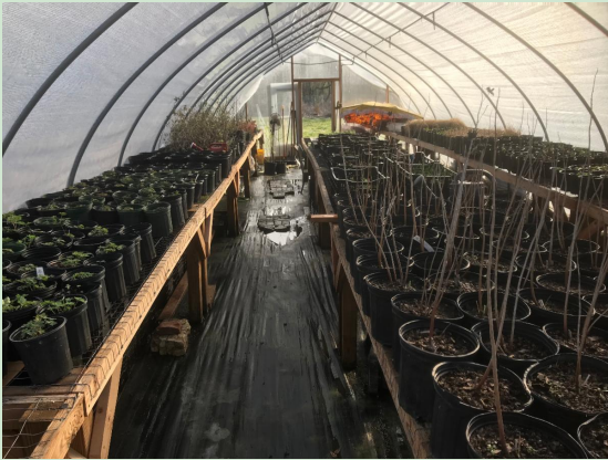
LandHealth's Nursery : PhilaFlora