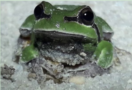
Pine Barrens tree frog ( Hyla andersonii )

info@landhealthinstitute.org if you are interested in joining our weekly lectures!