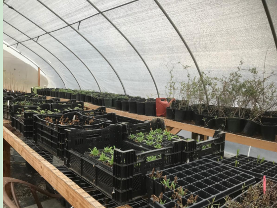
Plants for the Weavers Way Coop are being ready to be delivered.