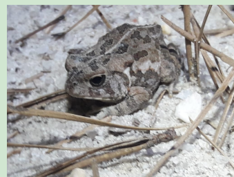
Fowler's Toad ( Anaxyrus fowleri )

Philadelphia Watershed Stewardship Program - in progress right now! SpArc Volunteer Program - still on hold