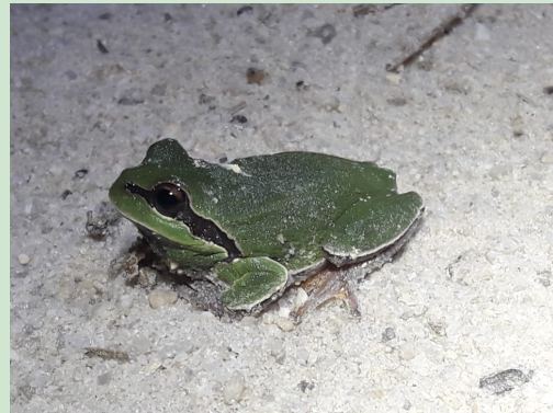
Pine Barrens tree frog ( Hyla andersonii )

We are continuing to grow many new plants at our nursery! Visit our nursery page to find more information about our nursery as well as why native plants could be the right choice for you!