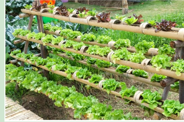
A hydroponic garden example

Hydroponic gardens are a new method of growing plants without using any soil. Read more about how to create your own garden here